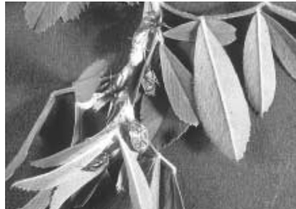
Figure 9. Lygus Bug Adults, Lygus hesperus . Lygus bugs and other plant bug feeding can cause severe damage to seed development in alfalfa.

Killing the beetles with insecticide may not solve the problem, as the dead insects still contain the toxin and their bodies may be raked and baled into the hay. The best alternative is to cut the alfalfa with a windrower that does not crush the plants and to selectively market the hay from later cuttings. This avoids the chance of feeding potentially contaminated hay to highly sensitive types of livestock.