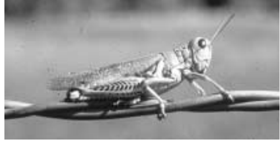
Figure 7. Differential Grasshopper. Occasionally, grasshoppers reach economically damaging populations in South Dakota.

Killing the beetles with insecticide may not solve the problem, as the dead insects still contain the toxin and their bodies may be raked and baled into the hay. The best alternative is to cut the alfalfa with a windrower that does not crush the plants and to selectively market the hay from later cuttings. This avoids the chance of feeding potentially contaminated hay to highly sensitive types of livestock.