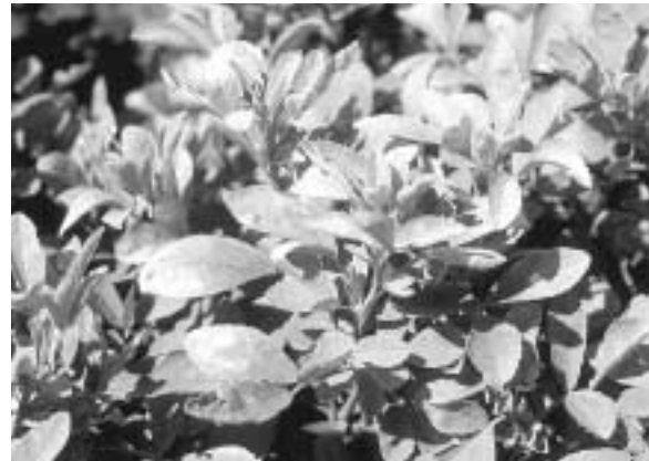
Figure 4. Potato Leafhopper damage. “Hopperburn” from the insect’s toxin is noted first as wedge-shaped yellow areas on leaf tips.

The potato leafhopper is very small, approximately 1/8 inch long, with piercing-sucking mouthparts. The nymphs often move sideways and backwards in a “crab-like” manner. Damage can be mistaken for drought stress; yellowing occurs on the leaves from the tip downward in a wedge shaped, or “v” pattern. Feeding results in stunting of plants, loss in yield, loss in plant vigor, and especially loss in hay quality. Protein content of