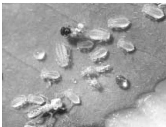
Figure 5. Spotted Alfalfa Aphid nymphs, Therioaphis maculata (Buckton). These insects most often cause damage during hot, dry weather. Note the molted skins of an adult (lower left) and of nymphs (lower center) and the parasitic chalcid wasp (top center).

The pea aphid and occasionally the spotted alfalfa aphid can potentially damage alfalfa in the state. Spotted alfalfa aphids, the smaller of the two species, are about 1/16 inch long and have four to six rows of spots on the back. This aphid injects a toxin into the plant when feeding, which causes leaf drop, and damage can be severe in seedling alfalfa stands. The pea aphid is larger in size, about 1/8 inch long and yellow to blue-green in color. This aphid can cause alfalfa to wilt if infestations are heavy. Pea aphid infestations are favored by cool, dry weather; where as spotted alfalfa aphid infestations are favored in hot, dry conditions.