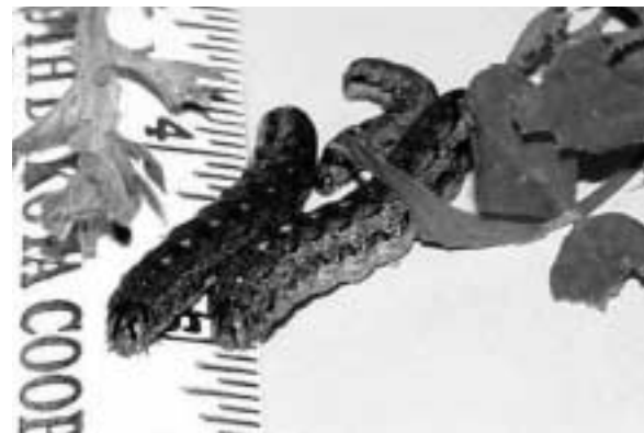
Figure 2. Variegated cutworms larvae, Peridroma saucia . Note the distinct spots along the back of the larvae.

Insecticides labeled for use on alfalfa to control cutworms include Ambush 2E, Baythroid, Lorsban