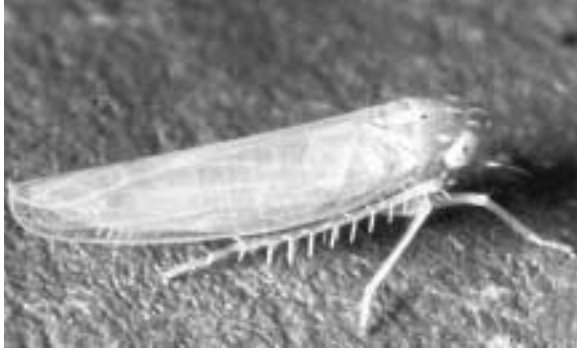
Figure 3. Potato Leafhopper, Empoasca fabae (Harris). Adults are minute insects, approximately 1/8 inch in length.

4E, Pounce 3.2 EC, and Warrior T. Sevin XLR PLUS may also be used for cutworms on alfalfa. The economic threshold of variegated cutworms on alfalfa is 2-4 larvae per square foot. Economic threshold can also be expressed as the number of days of delayed regrowth that can be tolerated. The thresholds vary with the cutting schedule of the grower, cost of treatment, and the market value of the alfalfa on the field.