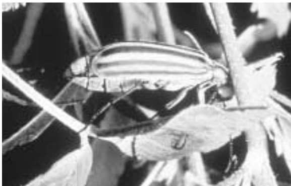
Figure 8. Blister Beetle, Epicauta spp. Several species of blister beetles can be found in alfalfa, including gray, black, margined and the striped blister beetle shown here.

Blister beetles do not damage the alfalfa crop directly, but they are highly toxic when ingested, especially by horses (the toxin is cantharadin). Blister beetles are a pest in later alfalfa cuttings, especially those cut in July, August, and September.