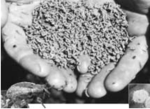
Figure 1. Alfalfa weevil adult (left), larvae (center), and pupae in cocoon (right). Alfalfa weevils can reach economically damaging populations in South Dakota alfalfa.

weevils are usually not a problem in eastern South Dakota. Perhaps there are natural enemies here that keep the weevils from reaching economic numbers. Parasitic wasps and a bacterial disease are known to affect alfalfa weevil populations.