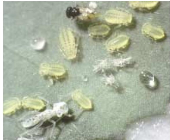
Spotted Alfalfa Aphid