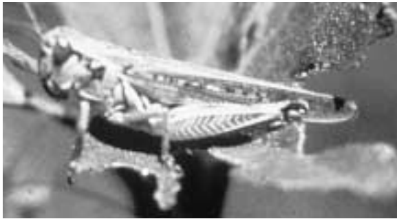
Figure 6. Migratory Grasshopper on legume. Many species of grasshoppers feed on alfalfa in South Dakota.

The two-striped grasshopper, migratory grasshopper, redlegged grasshopper, and the differential grasshopper are just a few of the species present in South Dakota. Most of the damaging species overwinter as eggs in the soil. Egg hatch begins in May and extends into June, depending on species.