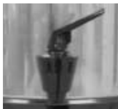
2. Approved spigot.