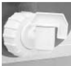
1. Approved spigot.