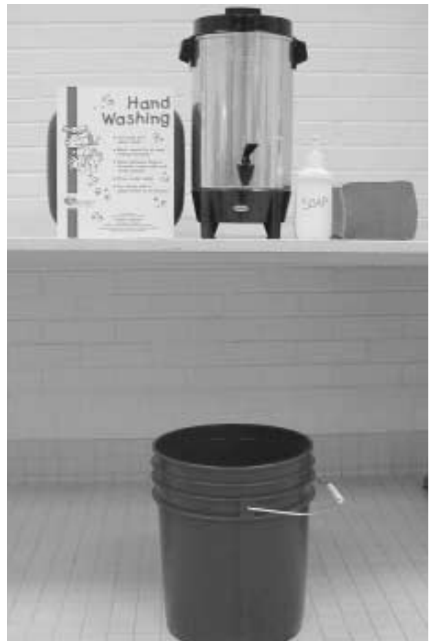
Example of temporary hand washing station.