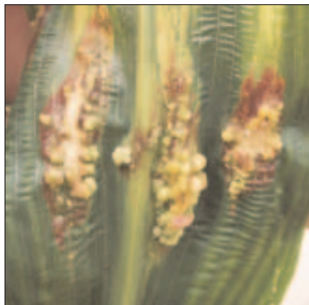
Figure 3. Leaf galls with mature common smut galls.

Yield losses are typically small, but the greatest yield loss will occur when the ear becomes infected or if smut galls form on the stalks immediately above the ears. If the galls are ruptured, clouds of dark brown spores are released. Very susceptible hybrids may suffer greater yield loss in very stressful years. Yield losses in field corn may appear to be significant when drought and stalk rots are also present. Because common smut is so visible, often blamed for the yield loss. Sweet corn may suffer greater loss due to diminished quality for canning