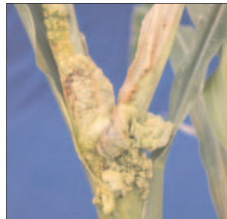
Figure 4. Corn stalk with smut galls at node and on new growth.