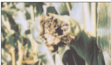
Figure 2. Young (top) and mature (bottom) common smut galls on corn ears.

C ommon smut is a frequently observed disease of sweet, pop, and dent corn in South Dakota and throughout the world. Corn smut usually is not economically important, although in some years yield losses in sweet corn may be as high as 20%. In parts of Mexico, immature smut galls are a part of the cuisine known as huitlacoche, a local delicacy.